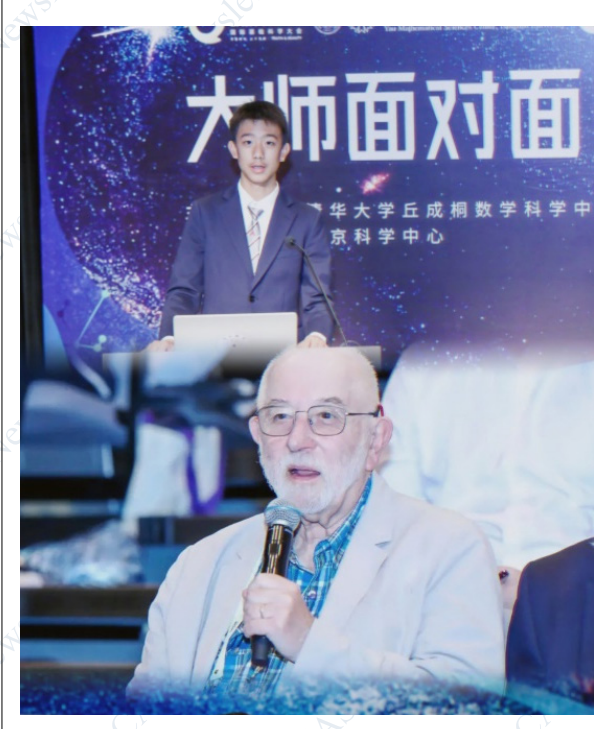
Student presentations and Q&A at the forum

research findings to experts at the forum.