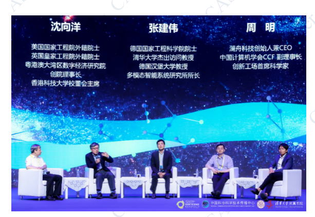
Panelists during the Q&A

The panelists also answered questions on model training, disciplinary barriers, and technological ethics