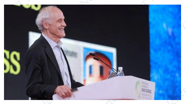
David J. Gross making a keynote presentation

Fields Medalist Hugo Duminil-Copin offered a unique perspective on the intrinsic beauty of mathematics. He likened mathematical research to an artistic journey, emphasizing that the process of exploration often outweighs the importance of reaching a destination.