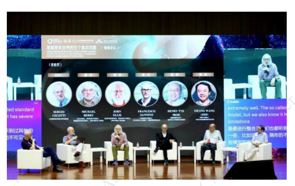
Panelists at the Fundamental Science Panel Discussions on Physics