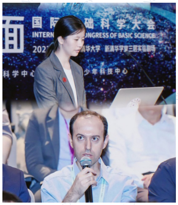
Student presentations and Q&A at the forum

Throughout the forum, students enjoyed meaningful interactions with renowned scientists and solicited their advice. The collaboration not only united the students with the scientific community but also enriched their comprehension of the importance of scientific research. It fostered thrills for scientific investigation, fueling enthusiasm for basic disciplines.